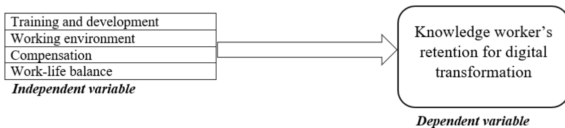
Figure 1. Research framework.

This research aims to determine factors affecting knowledge worker’s retention for digital transformation in SMEs in Malaysia. In Figure 1, it shows the research model.